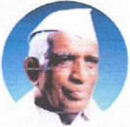
Founder President, Council of Education, Kolhapur