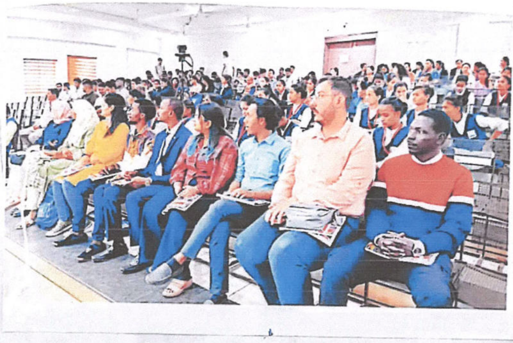
• Spellbound Foreign & Indian delegates.